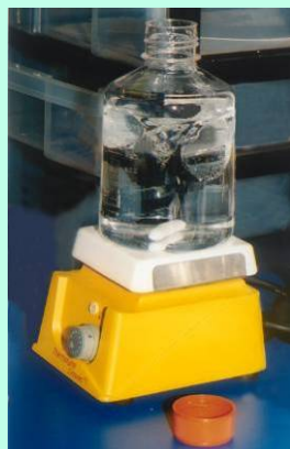
Prepare Wash/Extraction Buffer