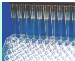
Add Conjugate, controls and samples