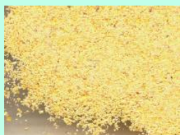
Correct 20 mesh grind for corn

*Available as accessories – see list on Page 3