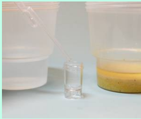
Add water to vial