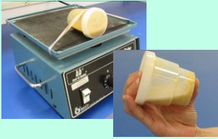
Shake mechanically or by hand