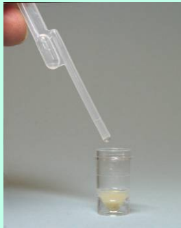
Add extract to vial