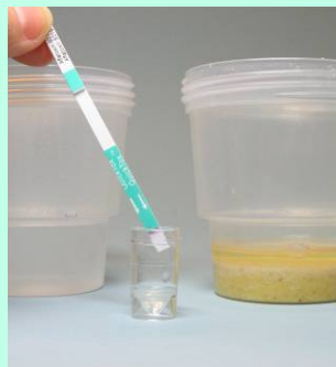
Place strip in vial