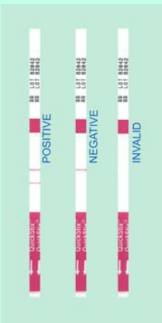
Any clearly discernable pink Test Line is considered positive