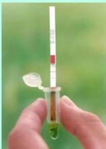
Insert QuickStix Strip