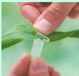
Obtain Leaf Tissue