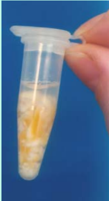
Extract Seed Sample