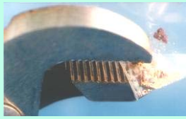
Crush single seed