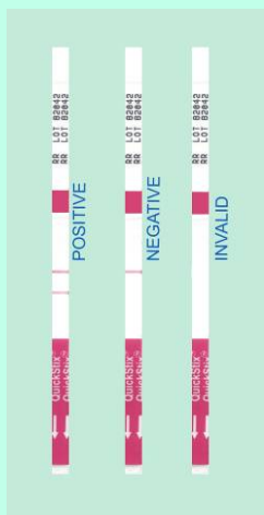
Any clearly discernable pink Test Line is considered positive