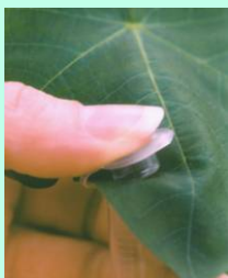
Obtain Leaf Tissue

Contact EnviroLogix to order bulk-packaged kits. Bulk kits include EB2 Extraction Buffer Concentrate. To prepare 1 liter, mix 50 mL 20x Concentrate with 950 mL of distilled or deionized water. Store refrigerated when not in use; allow to come to room temperature before using.