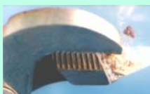
Crush single seed

Contact EnviroLogix to order bulk-packaged kits. Bulk kits include EB2 Extraction Buffer Concentrate. To prepare, mix 50 mL 20x Concentrate with 950 mL of distilled or deionized water per liter required. Store refrigerated when not in use; allow to come to room temperature before using.