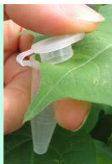
Obtain Leaf Tissue