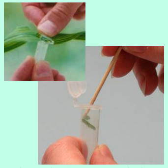
Obtain leaf tissue, push down