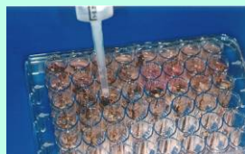
Add Extraction Buffer