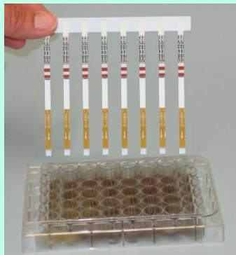
Insert Combs into plate

Any clearly discernable pink Test Line is considered positive