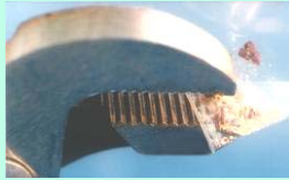
Crush single seed